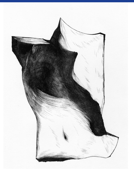
Fig. 5. From the series Shrine of the Post Hypnotic , 2012, ink on paper, courtesy the artist and Rodeo, Istanbul

Hüner's practice, the prehistoric world coexists with the modern, the natural world with the artificial.