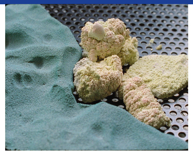
fig. 4. Aeolian Processes #2, 2012, 16mm film transferred to digital files, 6:36 min, courtesy the artist and Rodeo, Istanbul

appear more alien, situated in extraterrestrial landscapes (fig. 4). Many of the objects that appear in the films were first seen as part of another recent body of work, an installation entitled A Little Larger Than the Entire Universe (2012) which was shown last summer at Manifesta 9 , the European biennial. (In Hüner's practice, one body of work tends to lead to the next, uncovering areas of investigation that become the subject of a new body of work, and then the next, and so on.) The artist created many of the objects in that installation objects that would subsequently become the subjects of the films—while at the Rijksakademie residency in Amsterdam, where he made use of a ceramics laboratory and spray paint booth. Filled with accumulated dust, unused material, and the residue of so many past projects, the ceramics laboratory appeared to Hüner as the setting for a scale model of the universe. With its encrusted layers of brightly colored paint, metal plates used to carry clay to the kiln, and murky, plaster-filled water, the laboratory conjured up the surfaces of planets and other-worldly civilizations.