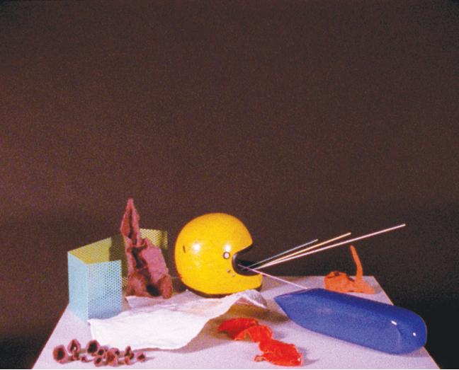
fig. 1. Aeolian Processes #1, 2012, 16mm film transferred to digital files, 10:30 min, courtesy the artist and Rodeo, Istanbul.

"I wanted to imagine modernism unearthed by some future archaeologist..." -T.J. Clark, Farewell To An Idea , 1999<sup>1</sup>