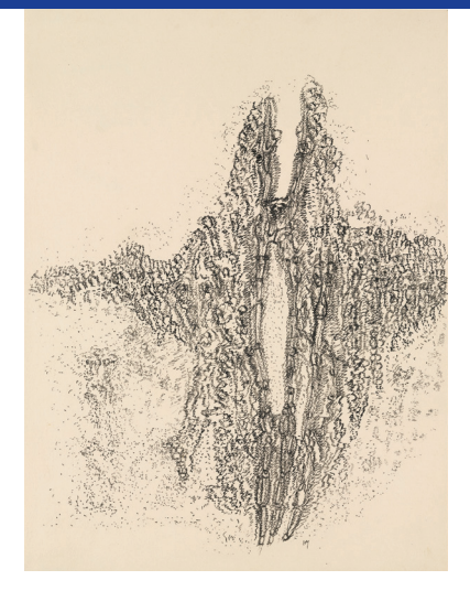
Fig. 6. Henri Michaux, Mescaline Drawing , 1960, ink on paper, Collection of the Museum of Modern Art, New York, Gift of Philip Johnson, 789.1969 © 2012 Henri Michaux / Artists Rights Society (ARS), New York & Paris

which the Surrealists sought to suspend self-censorship and rationality, gaining direct access to the unconscious.